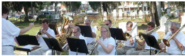
Coastal Brass Choir Concert in Oak Grove Cemetery

K of P - Knights of Pythias d/o, s/o - Daughter or Son of WOW - Woodmen of the World CSA - Confederate States of America UCV - United Confederate Veterans